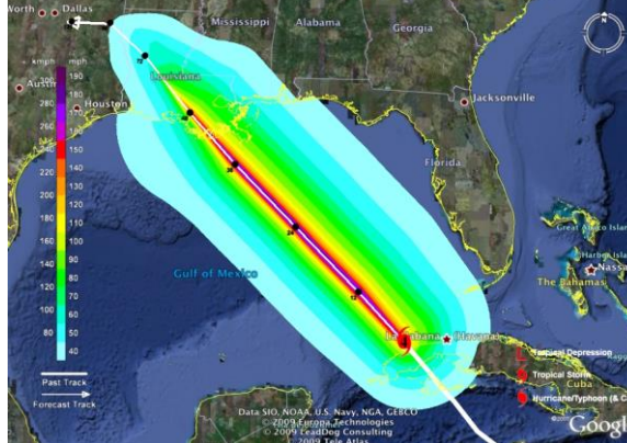
Product examples for Hurricane Gustav (2008). TSR forecast wind swathe (left) and TSR forecast gust swathe (right) issued at 09UT and 03UT respectively on 31st August 2008.