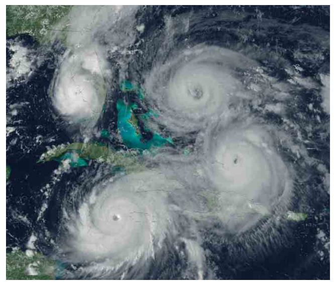
FIGURE 1. COMPOSITE SATELLITE IMAGE SHOWING HURRICANES CHARLEY, FRANCES, IVAN AND JEANNE "APPROACHING" FLORIDA AND US LANDFALL IN AUGUST AND SEPTEMBER 2004.